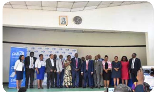
Newly appointed Board members after the election at AGM