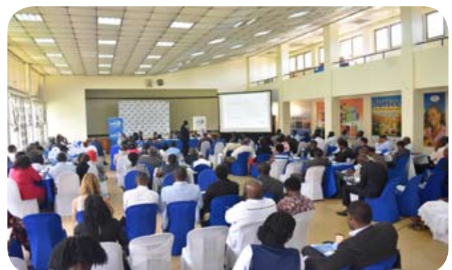
PSFU Members participating in the 23rd AGM