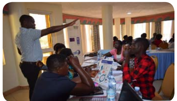
Representatives from business associations participate actively during the 5 days training at Ridar hotel, Seeta