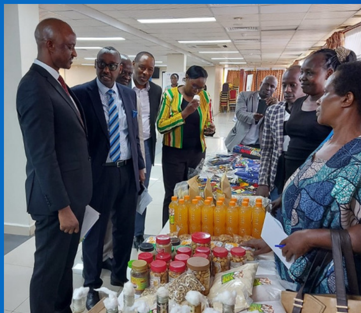
The PSST Mr. Ramathan Ggoobi inspects the stalls of beneficiaries of the SDF during the closing ceremony of the project at Hotel Africana, Kampala.