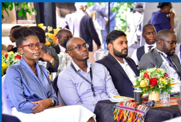
A group of private sector players attending the Presidential Private Sector CEO Forum at Chobe Safari Lodge, Nwoya.