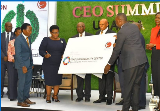
Chief Executive Officers and business leaders launching a sustainability Centre during the CEO Summit at Mestil Hotel, Kampala.

President Yoweri Museveni hosted the 3rd Presidential Private Sector CEO Forum at Chobe Safari Lodge in Nwoya in December 2022. The bi-annual Forum of Presidential CEO Forum brought together business leaders, investors, policymakers and academia to meet the president. The latest meeting was themed, "Unlocking the Private Sector Investment through Strategic Interventions for Socio-Economic Transformation. The President reiterated government's commitment to improving tarmac road coverage across the country and lowering the electricity tariffs so the cost of production goes down. He tasked the private sector to work with the government to look at water and railway transport too.